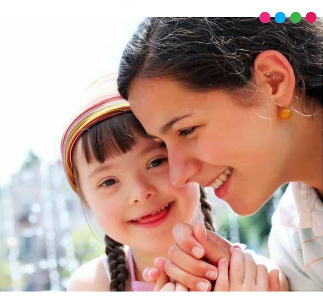
Tham Gia School Holiday Program - South